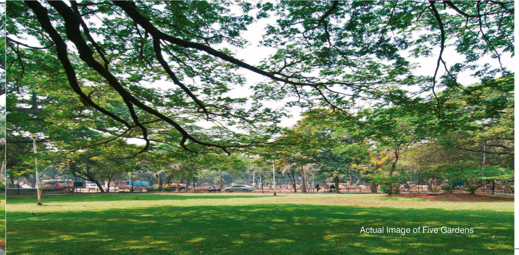
Actual Image of Five Gardens